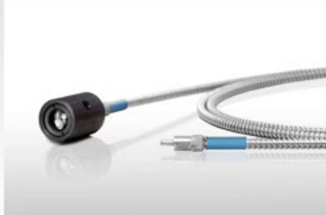
Ex-vacuum collimator optics with optical fiber.