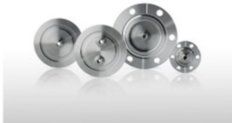
Optical vacuum feedthroughs in KF and CF flanges.