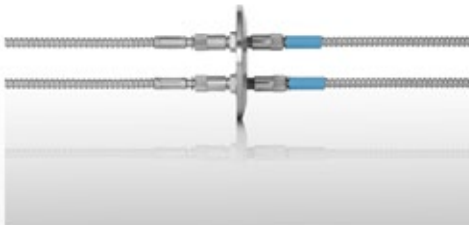
Multiple optical vacuum feedthroughs in single flange.

We are offering quartz fiber optics in slim size and miniature size for in-vacuum and ex-vacuum use made of stainless steel or aluminum. Especially designed collimator optics with straight and right-angled line of sight allow light detection even in process chambers with obstructed view. All in-vacuum collimator optics are equipped with a protection device to protect the optical surfaces against coating. Easy system integration of the in-vacuum optics is realized by optical vacuum feedthroughs in standard KF and CF flanges. All fiber connections are common SMA connectors.