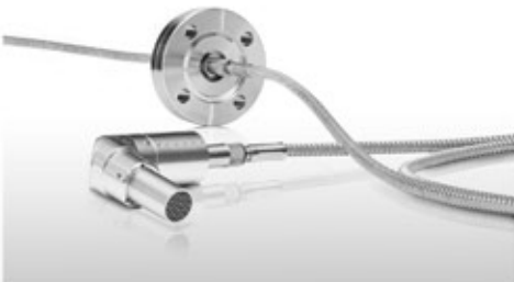
Assembled in-vacuum fiber optics set.