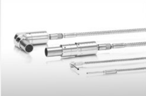
Slim and miniature size optics with coating protection device and optical fibers

Optical components are the interface between the application process and the detection system: the optics should transfer as much light intensity as possible and it should be flexible and resistant to industrial environments.